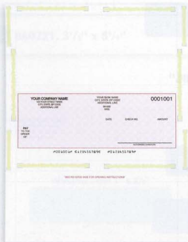
C 723101, 8 1/2" x 11", Imprinted Red Pantograph Z-Fold 1-Way 11" Check