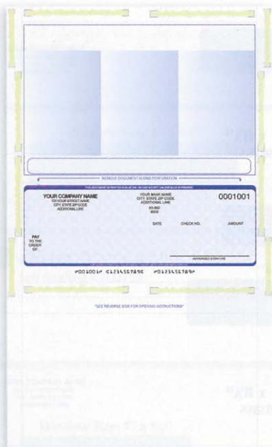
A 723104, 8 1/2" x 14", Imprinted Blue Pantograph, 1-Way 14" Z-Fold Check

Camera ready copy required for all Pressure Seal Products.