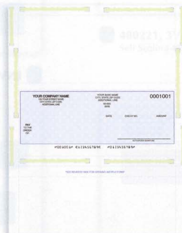
C 723102, 8 1/2" x 11", Imprinted Blue Pantograph Z-Fold 1-Way 11" Check