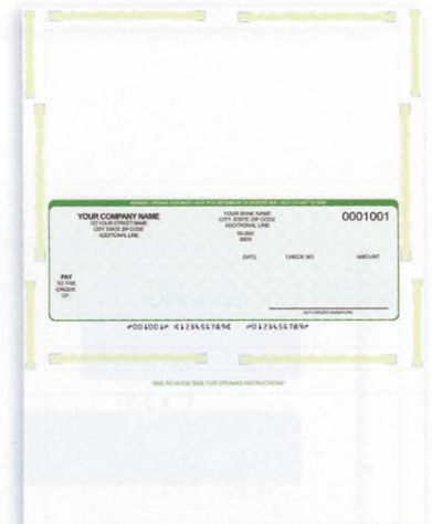
C 723103, 8 1/2" x 11", Imprinted Green Pantograph Z-Fold 1-Way 11" Check